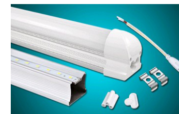
GNL - YTH-ALT8 - 48SMD-12W-CW-D

Suitable for showcase windows, cafes, restaurants, gift shop artwork, museum and deparment stores for merchandise displaying. Also good for family living room and bedroom's lighting and decoration.