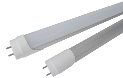
AL+PC LED T8 tubes